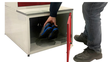
Storage & MFC top