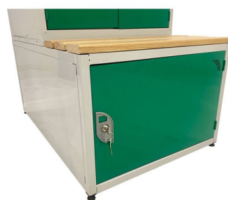
Storage & Oak Slat Seats (450mm high)