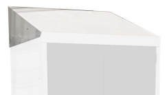
Sloping tops (150mm high)