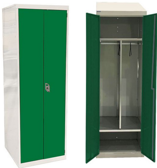
Storage & MFC top